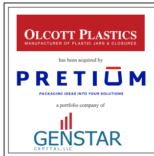
INJECTION & BLOW MOLDED PACKAGING