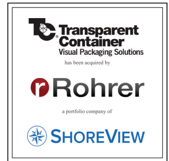
THERMOFORMED PACKAGING, FOLDING CARTONS