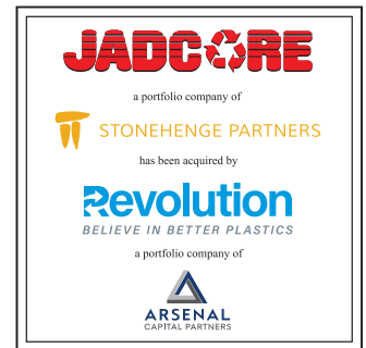
RECYCLING & FLEXIBLE PACKAGING