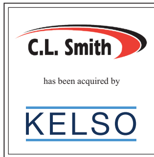
PACKAGING DISTRIBUTION & BLOW MOLDED PACKAGING