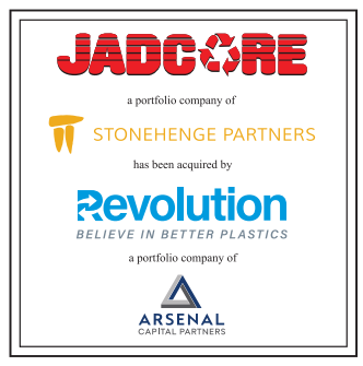
RECYCLING & FLEXIBLE PACKAGING