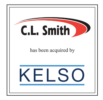
PACKAGING DISTRIBUTION & BLOW MOLDED PACKAGING