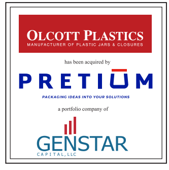
INJECTION & BLOW MOLDED PACKAGING