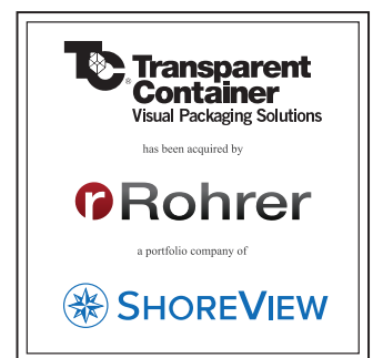
THERMOFORMED PACKAGING, FOLDING CARTONS