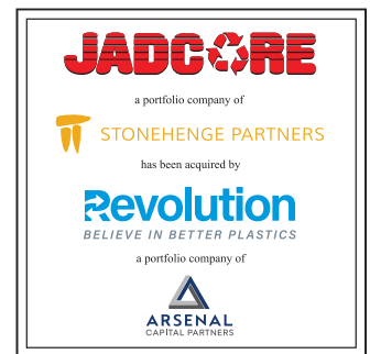
RECYCLING & FLEXIBLE PACKAGING