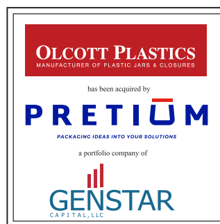
INJECTION & BLOW MOLDED PACKAGING