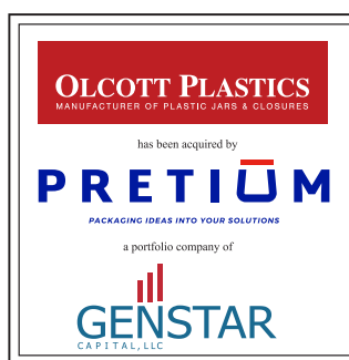
INJECTION & BLOW MOLDED PACKAGING