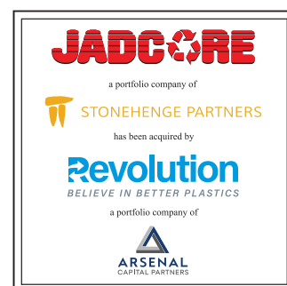
RECYCLING & FLEXIBLE PACKAGING