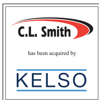
PACKAGING DISTRIBUTION & BLOW MOLDED PACKAGING